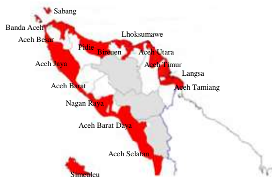
Fig. 1. The areas affected by tsunami in the Nanggroe Aceh Darussalam (NAD) province [11].

The study area is located in the northern part of the island of Sumatra, Indonesia. Aceh is one of a province in Indonesia officially named Nanggroe Aceh Darussalam. It is the western most province of the Indonesia with the Indian Ocean to the west, the strait of Malacca to the east, located between 2^{\circ} - 6^{\circ} North latitudes and 95^{\circ} - 98^{\circ} East longitudes with the area of approximately 57,365 \text{ km}^2 , or 12.26% of size of Sumatra Island. The Province of Nanggroe Aceh Darussalam is the most affected area by the tsunami of 26 December 2004. The Fig. 1, shows the areas affected by tsunami in Nanggroe Aceh Darussalam (NAD) province [11].