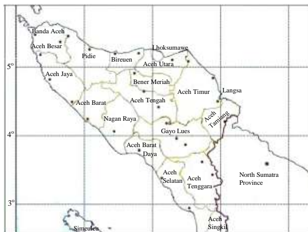
Fig. 2. The map of the Province of Aceh and the location of the soil sampling sites.

it is located. The geographical coordinates of the sampling point were recorded by using Global Positioning System, GPS Map 60CHx manufactured by Garmin.